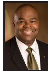
Don Thompson President & Chief Operating Officer McDonald's Corporation